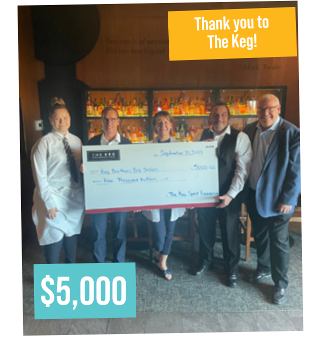
The Keg Spirit Foundation for their donation of $5,000