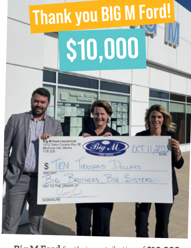
Big M Ford for their contribution of $10,000 toward in-school programming!!

Thank you to The Broken Llamas Pinatas for their monthly donation of a Birthday Pinata for our "Littles"