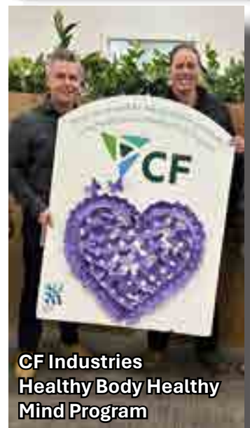
CF Industries Healthy Body Healthy Mind Program

At Auto-Star, we firmly believe in the transformative power of mentorship and the profound impact it has on shaping young lives. By investing in a young person's future through guidance and support, we aim to help them thrive and succeed. Through our partnership with the Big Brothers Big Sisters program, our dedicated staff has the invaluable opportunity to make a tangible difference in the lives of children and youth. By fostering their confidence, imparting essential life skills, and nurturing their potential, we contribute to creating a brighter future for all.