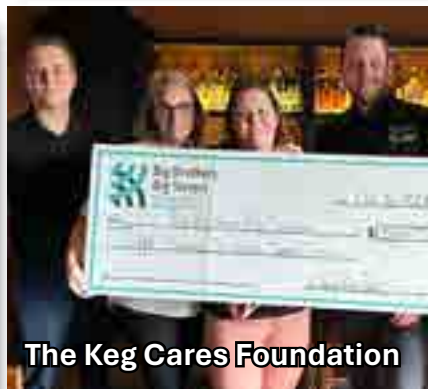
The Keg Cares Foundation