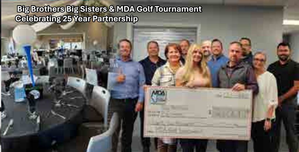
Big Brothers Big Sisters & MDA Golf Tournament Celebrating 25 Year Partnership