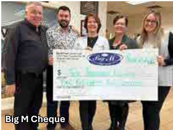
Big M Cheque