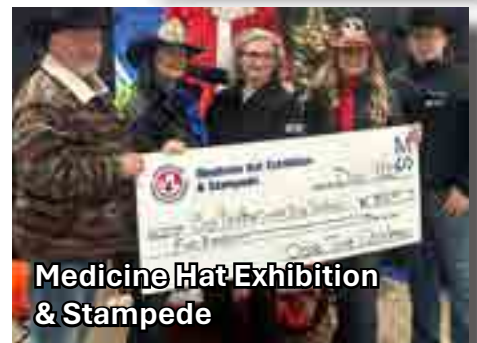
Medicine Hat Exhibition & Stampede