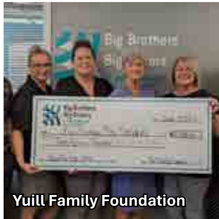
Yuill Family Foundation